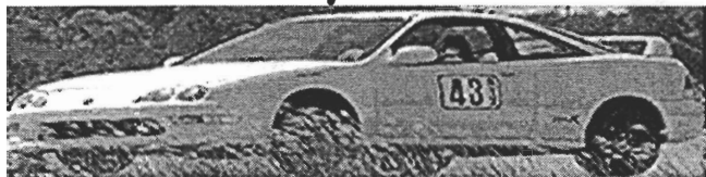
Class: stx #43 White Acura Integra Type R 2002 Carey Kriger